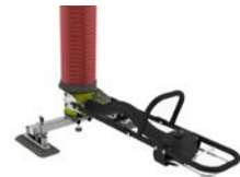
Flex handle with suction foot for boxes 630650