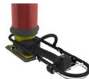
Flex handle with suction foot 610700