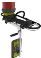
Flex handle with suction for side lifting 610850