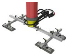
Flex handle with special spider yoke for lifting sheets