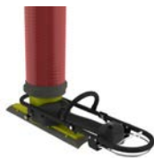
Flex handle with suction foot for reels 610400