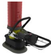
Standard handle with suction foot for sacks 630300