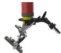
Flex handle with suction foot for sheets 610620, angle adapter 610810, and handle for angle adapter 610811