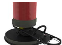
Suction foot for drums 650210