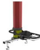
Fixed handle with hook tool 630460